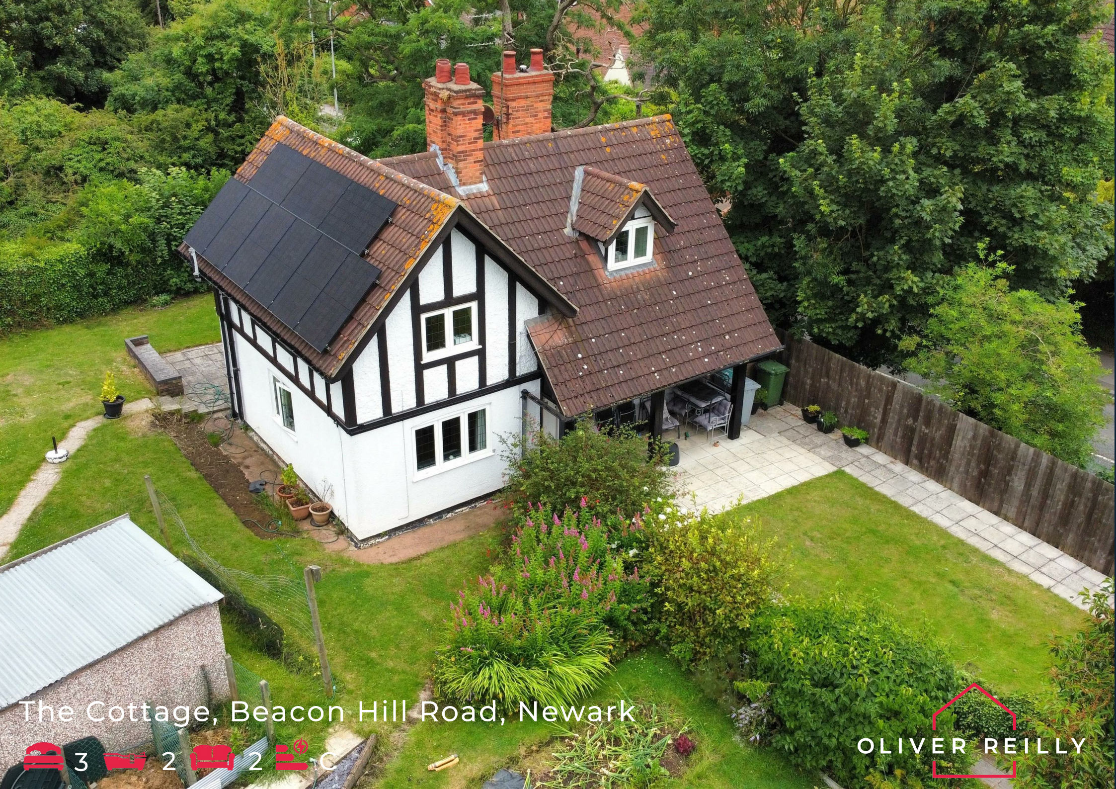
The Cottage, Beacon Hill Road, Newark